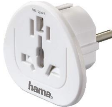
Travel adaptor for german sockets

As power sockets we use are German standard SCHUKO-sockets which can be used with SCHUKO-plugs, European plugs, or travel adapters.