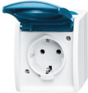
German SCHUKO power socket