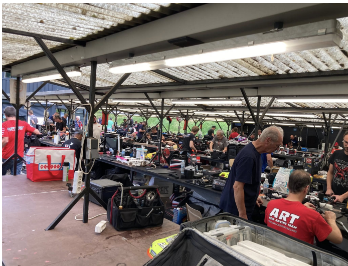
The paddock

The club has a large canteen and seating area. The paddock is covered and offers space for approx. 100 drivers at standing workstations, which are equipped with electricity and lighting. There is a toilet and a separate grinding area in the paddock.