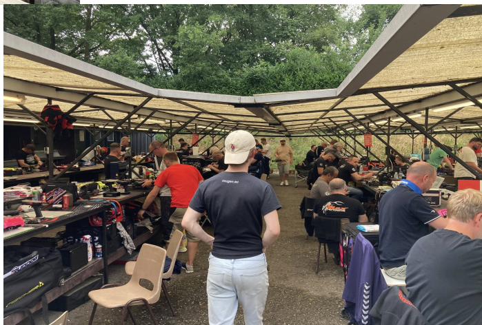
The paddock